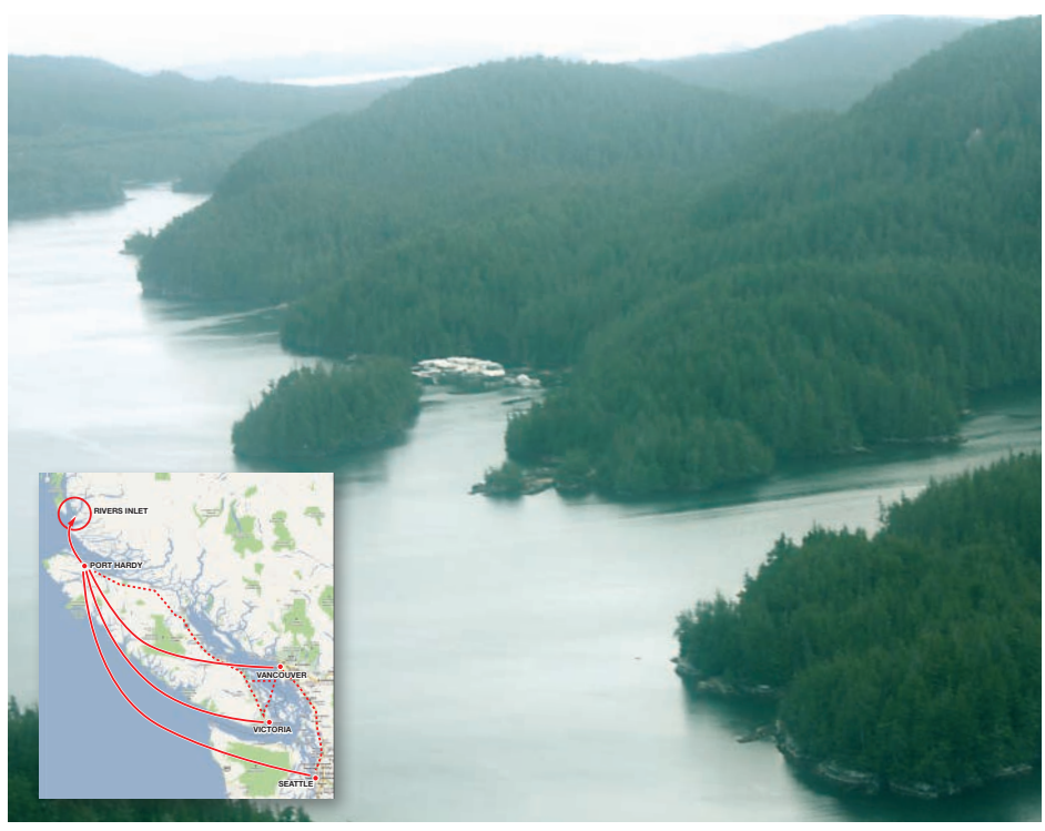
Enjoy a wilderness experience like none other when you visit Black Gold Lodge in Rivers Inlet, British Columbia, Canada. This remote destination is a self-contained, comfortable, modern, floating lodge in a sheltered harbor near the entrance to Rivers Inlet. Fly-in only and easy to get to from the destinations shown in the map above.