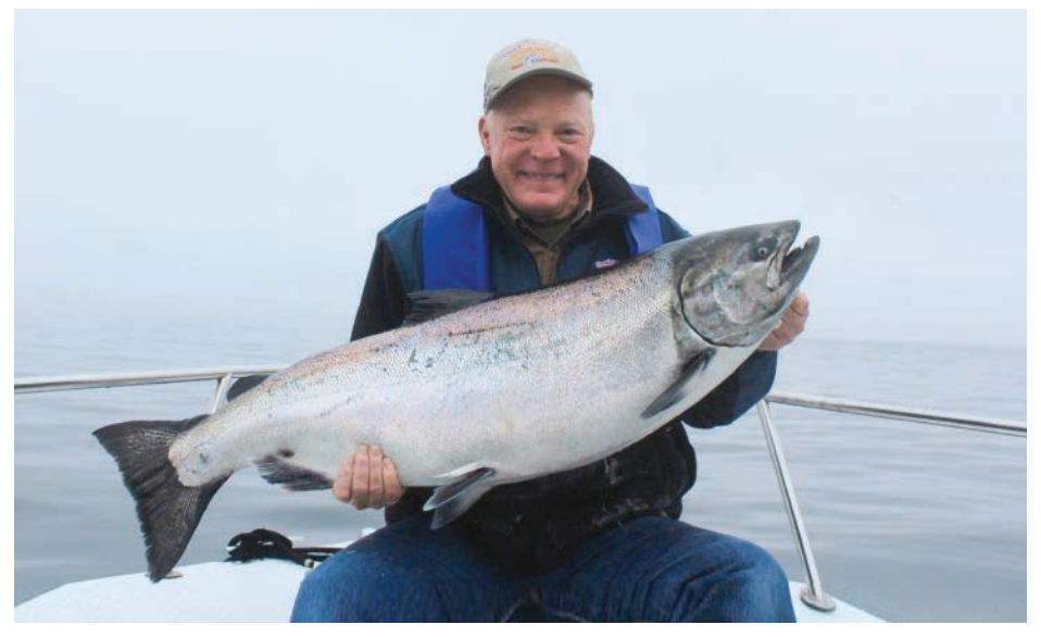
A good mornings catch!