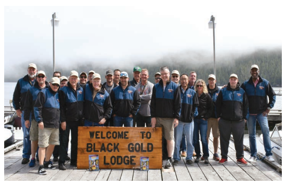
The Craig Boddington Salmon Fishing Tournament