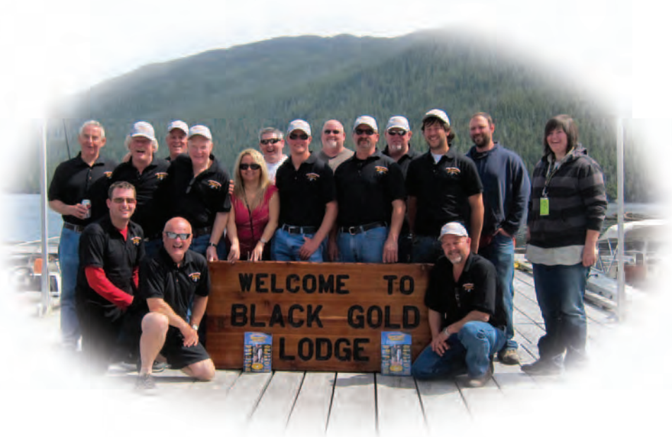
Boddington Tournament - Class of 2011