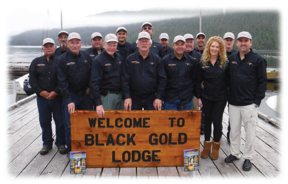
The Craig Boddington Salmon Fishing Tournament - Class of 2017